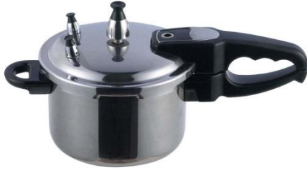
Pressure (in a good way!)