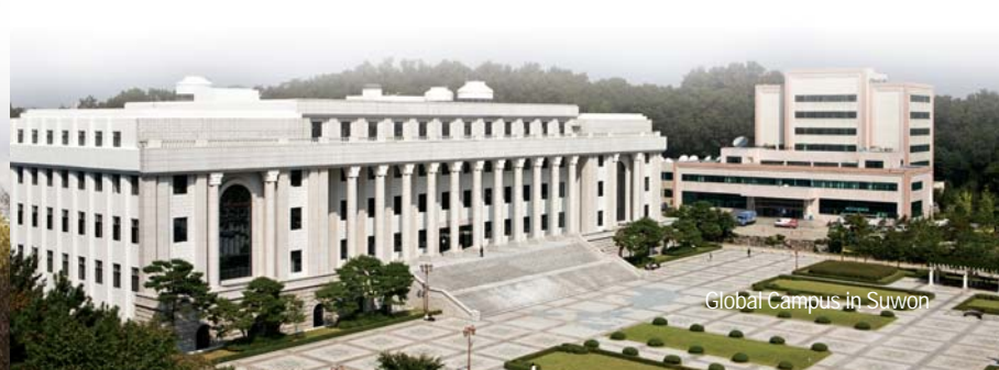
Global Campus in Suwon